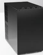
Chill CH390 40 litres

So, there is a solution for every venue type—whether you're a bustling café, a luxurious hotel, or a high-end event space. By selecting the right design, you can ensure a seamless blend of form and function, enhancing both the guest experience and operational efficiency.