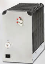
Chill CH80 10 litres