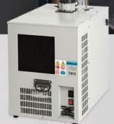
Glacier GL1300 210 litres