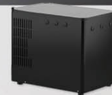
Club CL B100 120 litres