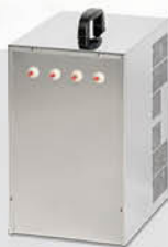
Chill CH270 16 litres