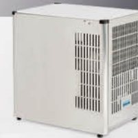
Club CL55 80 litres